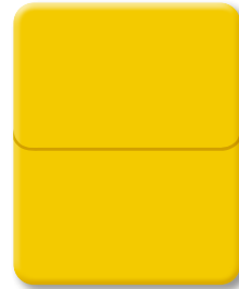
2% P. Y. 34 Lead Chromate Full shade in PP Hue angle -89°