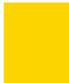
PV Fast Yellow H4G + P. Y. 184 Full shade in PVC