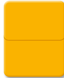
2% P. Y. 34 Lead Chromate Full shade in PP Hue angle -77°