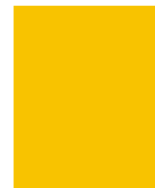
PV Fast Yellow H4G + P. Br. 24 Full shade in PVC