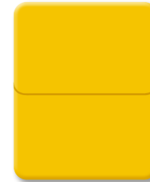
PV Fast Yellow H4G + P. Br. 24 Full shade in PP