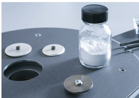
Thermal stability checked by Differential Scanning Calorimetry (DSC)