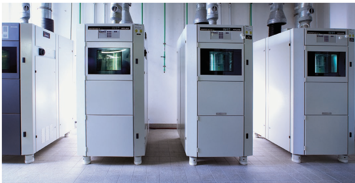
Light exposure for determination of light fastness

1 - Light fastness was determined in a draw down in a typical polyester toner resin.