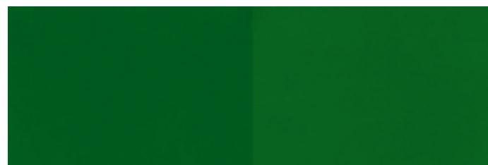
Leaf Green G 6557 N