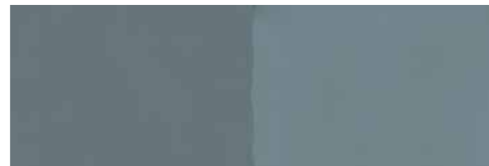
Blue Grey G 6528 N