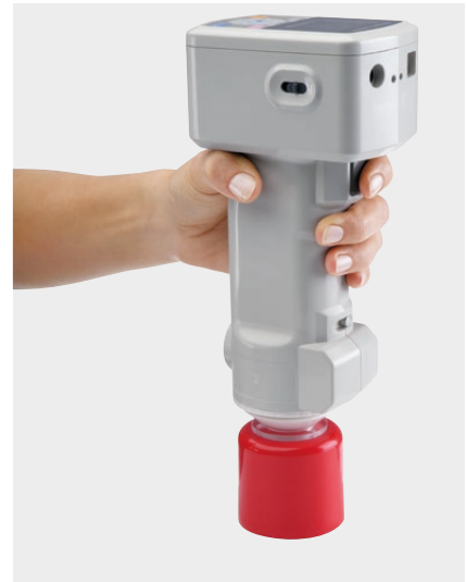
Color measurement of plastic article with spectrophotometer CM-700d